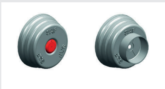
Wheel cap for SAF-O-Meter 4 304 0103 01

Axle series SK, example: Axle model SK RZ 12037