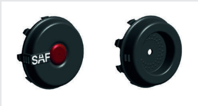
Wheel cap standard 4 304 0102 01

Axle series 06, example: Axle model S9-4218